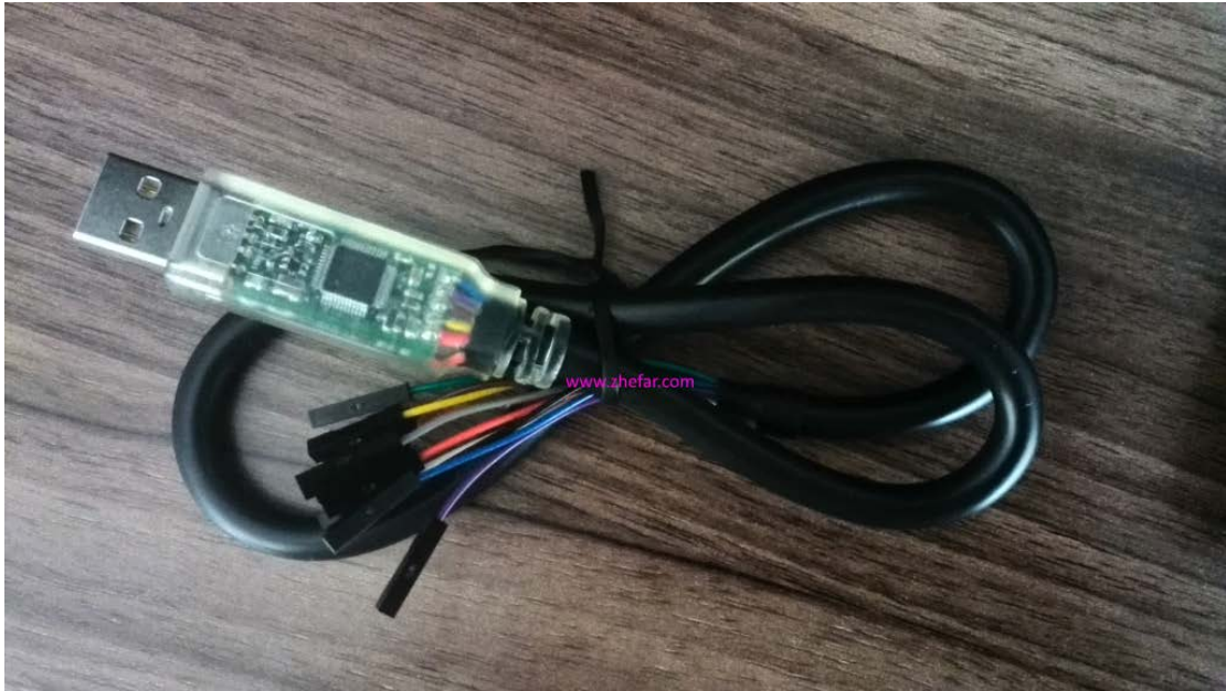
Figure 3 C232HM-DDHSL-0 Appearance